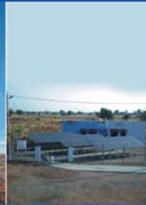
Off Grid System

DD Berg is a diversified company of Bergen Group having multinational foot prints in the field of Research and Development, Consultancy, Turnkey Solutions in the sector of Electronics Manufacturing and Renewable Energies.